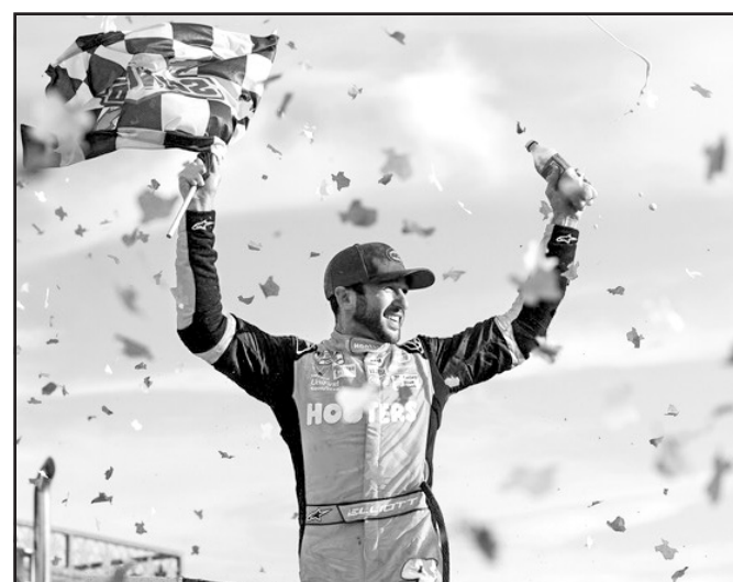
Elliott Gets Hard Fought Victory